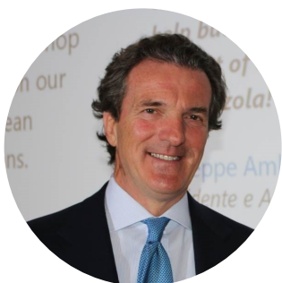
Giuseppe Ambrosi Ambrosi SpA

I love all types of cheese and I cannot help but surrendering in front of a piece of Gorgonzola.